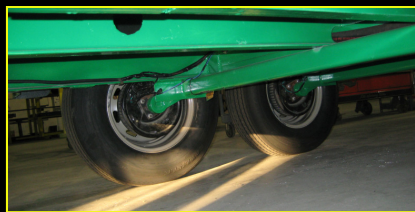
Heavy Duty Running Gear, High Ground Clearance Torsion Axles with 4- Wheel Electric Brakes