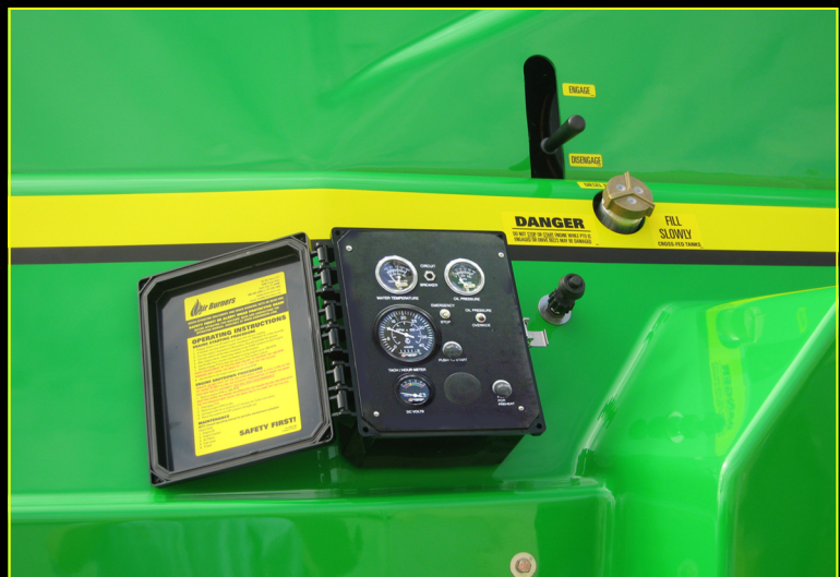
Full Engine Instrumentation with Fuel Gauge and Engine Key Switch. Locking Instrument Box, Protected Machinery and External Controls