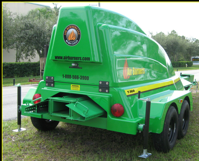
Folding Retractable Manifold, Stabilizer Jacks, Street Legal Tail and Marker Lights, License Plate Bracket