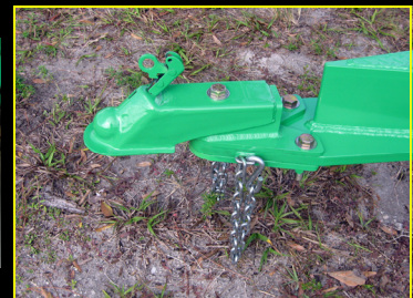
Removable 2 5/16" Ball Hitch and Pintle Hitch