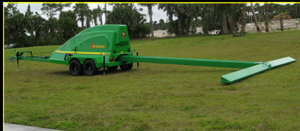
Manifold Unfolded with 20 Foot Safety Set Back. Trench Size - 30 Feet.